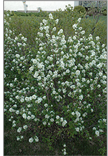
Northline Saskatoon in bloom

Northline Saskatoon is covered in stunning clusters of white flowers rising above the foliage from early to mid spring before the leaves. It has dark green deciduous foliage. The oval leaves turn an outstanding yellow in the fall. It features an abundance of magnificent blue berries in late spring.