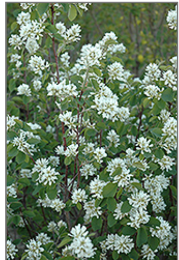
Northline Saskatoon flowers