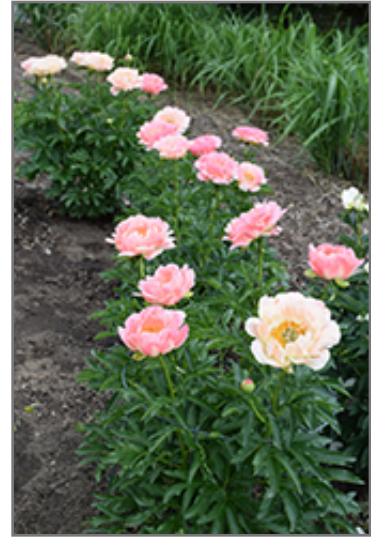
Coral Sunset Peony in bloom

This plant does best in full sun to partial shade. It does best in average to evenly moist conditions, but will not tolerate standing water. It is not particular as to soil pH, but grows best in rich soils. It is somewhat tolerant of urban pollution. This particular variety is an interspecific hybrid. It can be propagated by division; however, as a cultivated variety, be aware that it may be subject to certain restrictions or prohibitions on propagation.