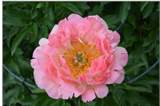
Coral Sunset Peony flowers (faded)