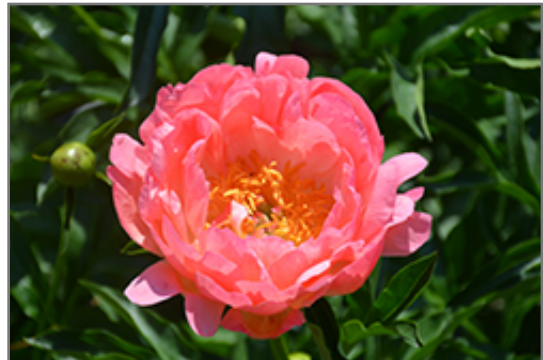
Coral Sunset Peony flowers